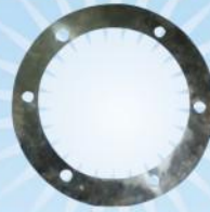
SHIM WITH HOLES